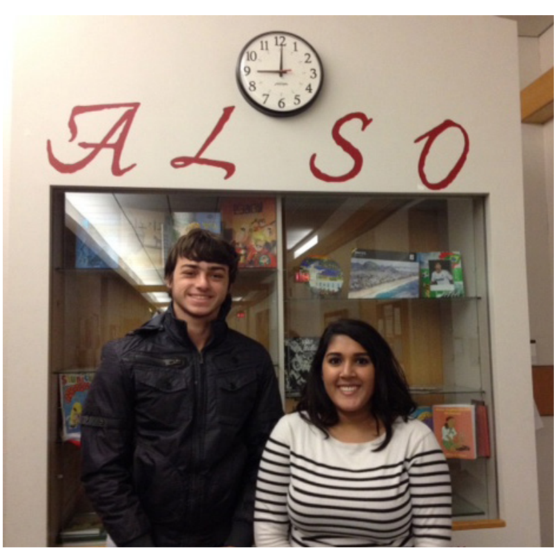
The ALSO program is housed on the third floor of ARH.

At many colleges and universities, Korean language classes are offered as regular for-credit, foreign language courses. I considered it strange and unfortunate that at Grinnell, it was taught in a non-traditional class setting, and only as a 2-credit course. Also, the College's East Asian languages department were limited to Chinese and Japanese. These facts misguided me to interpret that