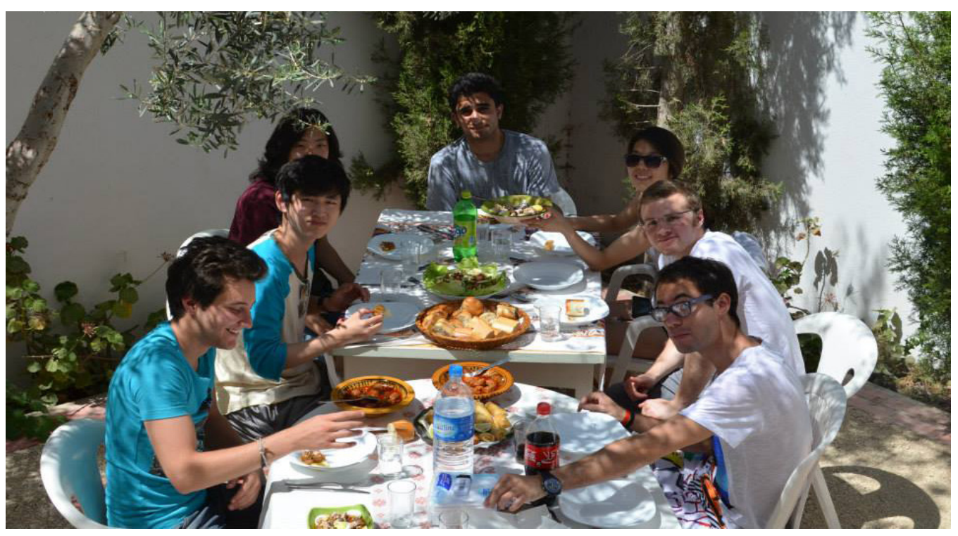
Grinnellians enjoying a Tunisian meal à la carte outdoors

While I had many amazing experiences, the highlight of my trip to Tunisia was the time I spent in the great Sahara desert. I'd heard of the place a long time ago, when I was just a little boy watching a science channel in China. I'd imagined visiting the greatest desert on planet Earth. I never thought that my dream from childhood would ever come true, but it did. On the way through the Sahara, everything seemed dead, as if the souls of all the creatures had been taken away and there was nothing left but skeletons. Around us, everything was golden yellow, and the sun was so powerful and imposing as if it was trying to drain every single bit of water out of our bodies. Sand would instantly fill my mouth and eyes, when I tried to breathe or even open my eyes.