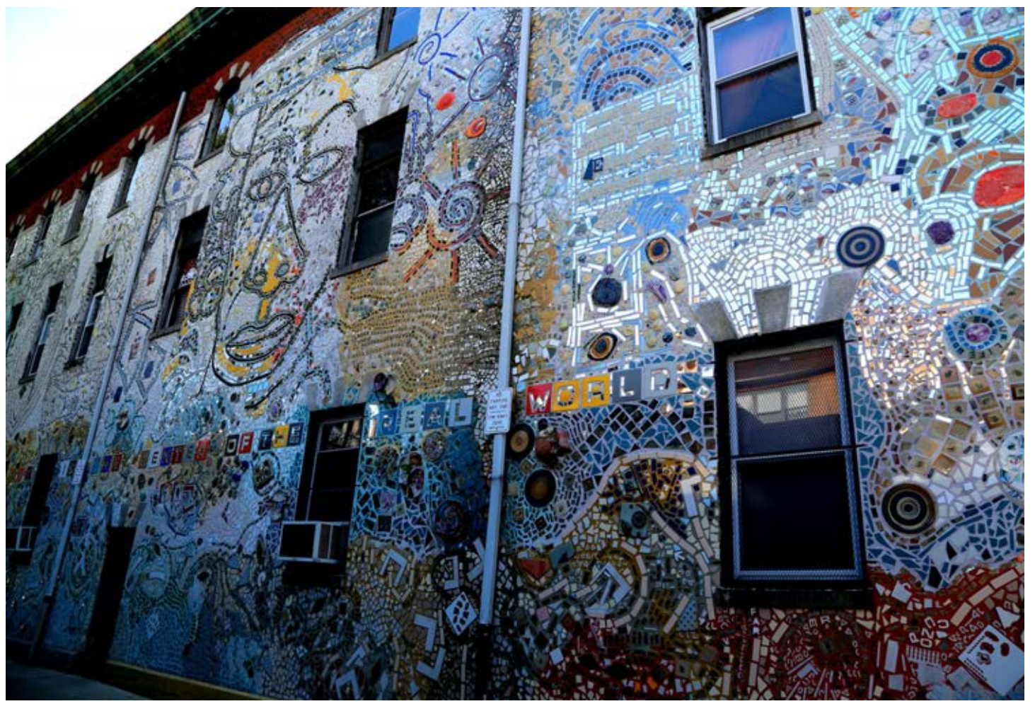
Philadelphia: South Street Mosaic