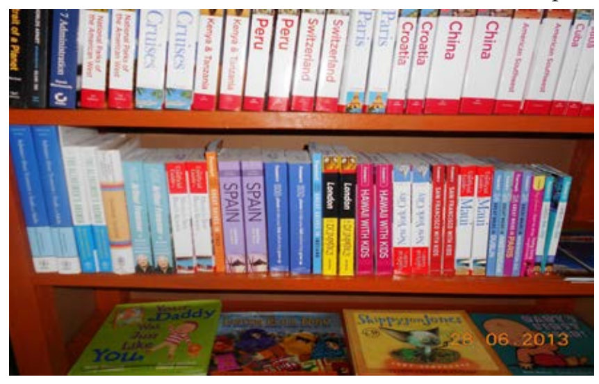
Shelves in the new library...

Charduani Middle School has many bright young minds that could greatly contribute to the development of their country, if given the right tools. However, due to lack of support, these potential leaders are dwindling in number. The children and their parents fail to understand the benefits of education, and lose their interest because they lack exposure to the world