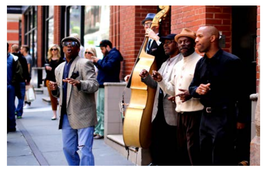
Street performance in Soho, New York

as well as other enjoyable activities, but it was these "emotionally heavy" encounters that made me think and adapt to a more mature understanding of U.S. society. However, this trip does not make me love this country any less. With all of its diverse races and cultures, with all of its technological and social revolutions, the United States of America is still a world superpower. The trip gave me a chance to know myself better, develop my conversation and independence skills, deepen my love of photography, and learn more about this great nation and her people.