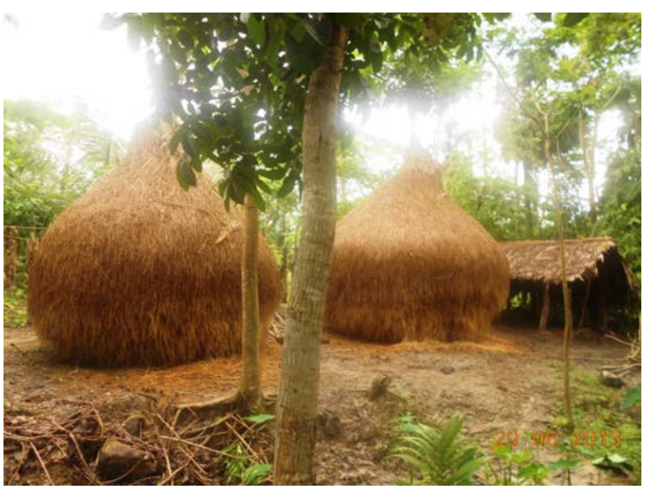
A glimpse of the village...

I am extremely grateful to the Davis Foundation for giving me the opportunity to make such a big difference in the lives of the young enthusiastic students of Charduani Village, and I believe that with the help of such great organizations, I will be able to make this world a much more peaceful place, and alleviate its pain.