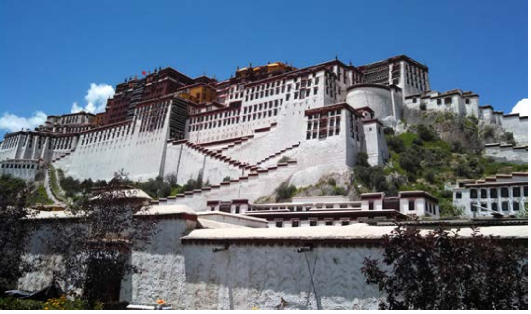
View of Lhassa, capital of Tibet

Apart from the breathtaking landscape, the human and cultural experience was even more interesting. Though I did not have the chance to interact directly with many Tibetans, I was amazed by their hospitality. Watching a Tibetan monk praying by a 3000kg golden statue of Buddha is a once in a life-time experience.